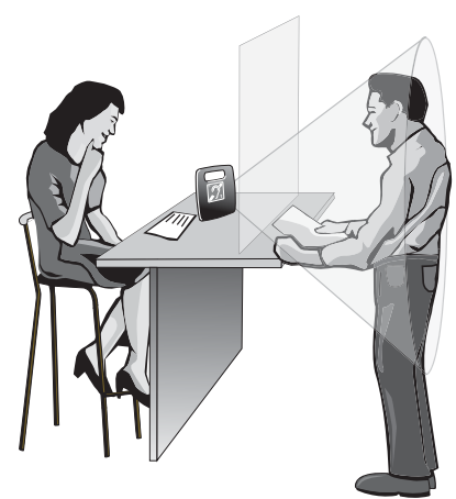
Figure 1 : Typical counter / ticket booth application