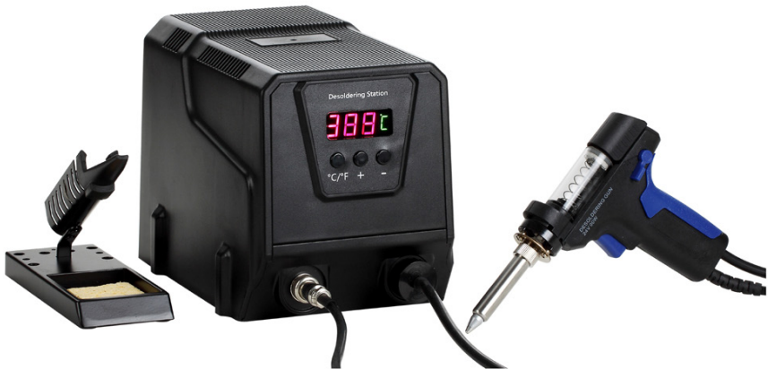
90W Digital Desoldering Station Model: MP740415