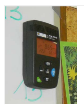
Large number of mounting options: magnetic, with padlockable wall support, with desktop stand or hung on wall hook.