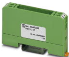
Custom circuit module, consisting of housing, MKDS 3 connection terminal blocks and PCB

Please be informed that the data shown in this PDF Document is generated from our Online Catalog. Please find the complete data in the user's documentation. Our General Terms of Use for Downloads are valid ( http://phoenixcontact.com/download )