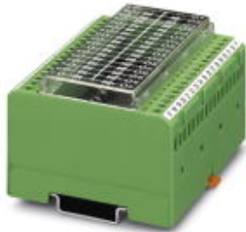
Diode module, for extension with 32 1N 4007 diodes, common cathode

Please be informed that the data shown in this PDF Document is generated from our Online Catalog. Please find the complete data in the user's documentation. Our General Terms of Use for Downloads are valid ( http://phoenixcontact.com/download )