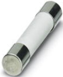
Replacement fuse for Inline power and segment terminals with fuse

Please be informed that the data shown in this PDF Document is generated from our Online Catalog. Please find the complete data in the user's documentation. Our General Terms of Use for Downloads are valid ( http://phoenixcontact.com/download )