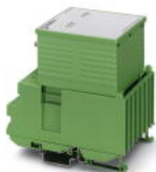
Replacement module electronics for IB ST (ZF) 24 BK-T

Please be informed that the data shown in this PDF Document is generated from our Online Catalog. Please find the complete data in the user's documentation. Our General Terms of Use for Downloads are valid ( http://phoenixcontact.com/download )