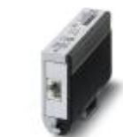
Surge protection in accordance with Class E A (CAT6 A ), for Gigabit Ethernet (up to 10 Gbps), token ring, FDDI/ CDDI, ISDN, and DS1. Suitable for Power over Ethernet (PoE+) "Mode A" and "Mode B". RJ45 attachment plug with separate grounding cable and ground connection snap-on foot for NS 35 DIN rails.

Surge protection device - DT-LAN-CAT.6+ - 2881007