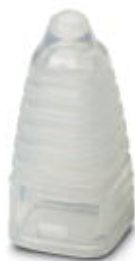
Accessories, IP54 protection for patch cable, use with FL IP54 FLANGE ...

Please be informed that the data shown in this PDF Document is generated from our Online Catalog. Please find the complete data in the user's documentation. Our General Terms of Use for Downloads are valid ( http://phoenixcontact.com/download )