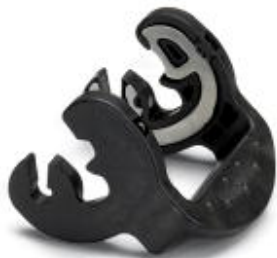
Replacement latch for HC-B10 / HC-B16/ HC-B24 housings with double locking latch (plastic design)

Please be informed that the data shown in this PDF Document is generated from our Online Catalog. Please find the complete data in the user's documentation. Our General Terms of Use for Downloads are valid ( http://phoenixcontact.com/download )