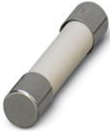
Output fuse (5x20 mm) acc. to IEC 127-2/EN 60127-2, 2 A fast blow

Please be informed that the data shown in this PDF Document is generated from our Online Catalog. Please find the complete data in the user's documentation. Our General Terms of Use for Downloads are valid ( http://phoenixcontact.com/download )