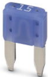
Fuse, nominal current: 15 A, length: 11.9 mm, width: 3.8 mm, height: 16.2 mm

Please be informed that the data shown in this PDF Document is generated from our Online Catalog. Please find the complete data in the user's documentation. Our General Terms of Use for Downloads are valid ( http://phoenixcontact.com/download )