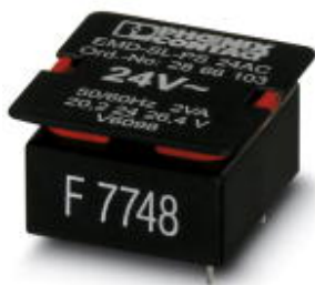
Power modules, pluggable, for EMD-SL-..., supply voltage: 20.2...26.4 V AC

Please be informed that the data shown in this PDF Document is generated from our Online Catalog. Please find the complete data in the user's documentation. Our General Terms of Use for Downloads are valid ( http://phoenixcontact.com/download )