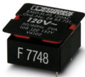
Power modules, pluggable, for EMD-SL-..., supply voltage: 108 V AC ... 132 V AC

Please be informed that the data shown in this PDF Document is generated from our Online Catalog. Please find the complete data in the user's documentation. Our General Terms of Use for Downloads are valid ( http://phoenixcontact.com/download )