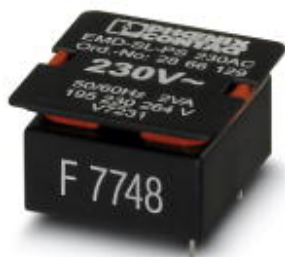
Power modules, pluggable, for EMD-SL-..., supply voltage: 195...264 V AC

Please be informed that the data shown in this PDF Document is generated from our Online Catalog. Please find the complete data in the user's documentation. Our General Terms of Use for Downloads are valid ( http://phoenixcontact.com/download )