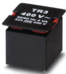
Power modules, pluggable, for EMD-FL-..., supply voltage: 323...456 V AC

Please be informed that the data shown in this PDF Document is generated from our Online Catalog. Please find the complete data in the user's documentation. Our General Terms of Use for Downloads are valid ( http://phoenixcontact.com/download )