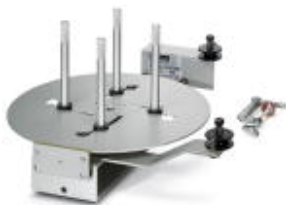
Cable roller for CUTFOX 10

Please be informed that the data shown in this PDF Document is generated from our Online Catalog. Please find the complete data in the user's documentation. Our General Terms of Use for Downloads are valid ( http://phoenixcontact.com/download )