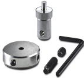
Stamping bit, for bore holes: 4.3 mm diameter

Please be informed that the data shown in this PDF Document is generated from our Online Catalog. Please find the complete data in the user's documentation. Our General Terms of Use for Downloads are valid ( http://phoenixcontact.com/download )