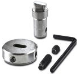
Stamping bit, for elongated holes: 5.5 x 12 mm

Please be informed that the data shown in this PDF Document is generated from our Online Catalog. Please find the complete data in the user's documentation. Our General Terms of Use for Downloads are valid ( http://phoenixcontact.com/download )