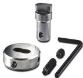
Stamping bit, for elongated hole: 6.5 x 15 mm

Please be informed that the data shown in this PDF Document is generated from our Online Catalog. Please find the complete data in the user's documentation. Our General Terms of Use for Downloads are valid ( http://phoenixcontact.com/download )