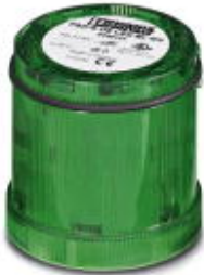
LED blinking light element, 24 V AC/DC, green

Please be informed that the data shown in this PDF Document is generated from our Online Catalog. Please find the complete data in the user's documentation. Our General Terms of Use for Downloads are valid ( http://phoenixcontact.com/download )