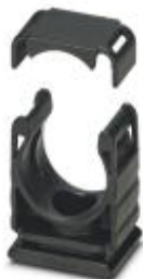
Hose holder with cover

Please be informed that the data shown in this PDF Document is generated from our Online Catalog. Please find the complete data in the user's documentation. Our General Terms of Use for Downloads are valid ( http://phoenixcontact.com/download )