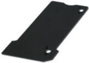
Adapter plate for accommodating US sheets

Please be informed that the data shown in this PDF Document is generated from our Online Catalog. Please find the complete data in the user's documentation. Our General Terms of Use for Downloads are valid ( http://phoenixcontact.com/download )