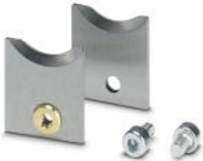
Replacement knife, for the CUTFOX 10 cutting machine

Please be informed that the data shown in this PDF Document is generated from our Online Catalog. Please find the complete data in the user's documentation. Our General Terms of Use for Downloads are valid ( http://phoenixcontact.com/download )