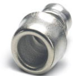
End sleeves as cable protection, made of brass

Please be informed that the data shown in this PDF Document is generated from our Online Catalog. Please find the complete data in the user's documentation. Our General Terms of Use for Downloads are valid ( http://phoenixcontact.com/download )