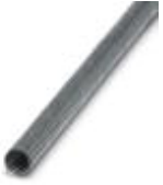
Protective hose in stainless steel

Protective hose - WP-STEEL S 10 - 3240686