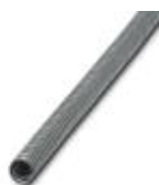
Protective hose in galvanized steel

Protective hose - WP-STEEL ZC 10 - 3240697