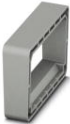
Spacer plate for PLW 16-6/5 feed-through terminal block

Please be informed that the data shown in this PDF Document is generated from our Online Catalog. Please find the complete data in the user's documentation. Our General Terms of Use for Downloads are valid ( http://phoenixcontact.com/download )