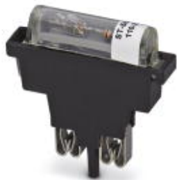
Fuse plug, nominal current: 6.3 A, length: 45.4 mm, width: 9.9 mm, color: black

Please be informed that the data shown in this PDF Document is generated from our Online Catalog. Please find the complete data in the user's documentation. Our General Terms of Use for Downloads are valid ( http://phoenixcontact.com/download )