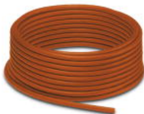
Hybrid cable, length: 50 m, color of outer sheath: orange RAL 2003

Please be informed that the data shown in this PDF Document is generated from our Online Catalog. Please find the complete data in the user's documentation. Our General Terms of Use for Downloads are valid ( http://phoenixcontact.com/download )