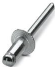
Blind rivets, Ø 4.8 mm, 12 mm sleeve length, aluminum sleeve, zinc-plated steel pin, flat head, standard version similar to DIN 7337 A

Please be informed that the data shown in this PDF Document is generated from our Online Catalog. Please find the complete data in the user's documentation. Our General Terms of Use for Downloads are valid ( http://phoenixcontact.com/download )