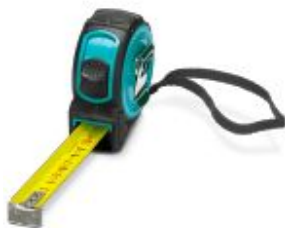
Tape measure, 5 m

Please be informed that the data shown in this PDF Document is generated from our Online Catalog. Please find the complete data in the user's documentation. Our General Terms of Use for Downloads are valid ( http://phoenixcontact.com/download )