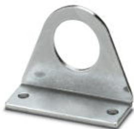
Fixing bracket for protective sleeves, fixed with two screws

Please be informed that the data shown in this PDF Document is generated from our Online Catalog. Please find the complete data in the user's documentation. Our General Terms of Use for Downloads are valid ( http://phoenixcontact.com/download )