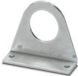
Fixing bracket for protective sleeves, fixed with two screws

Please be informed that the data shown in this PDF Document is generated from our Online Catalog. Please find the complete data in the user's documentation. Our General Terms of Use for Downloads are valid ( http://phoenixcontact.com/download )