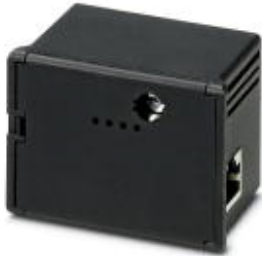
Ethernet communication module for the EEM-MA600 with integrated web server

Please be informed that the data shown in this PDF Document is generated from our Online Catalog. Please find the complete data in the user's documentation. Our General Terms of Use for Downloads are valid ( http://phoenixcontact.com/download )