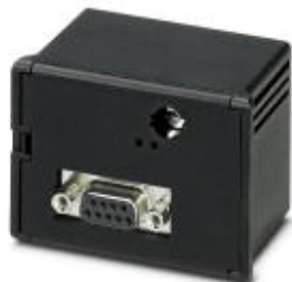
PROFIBUS (12 Mbps) communication module for EEM-MA600

Please be informed that the data shown in this PDF Document is generated from our Online Catalog. Please find the complete data in the user's documentation. Our General Terms of Use for Downloads are valid ( http://phoenixcontact.com/download )