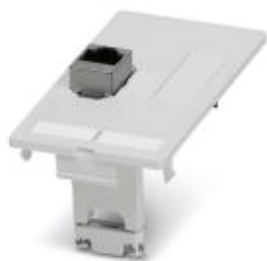
Front plate with contact inserts, plastic, 1 x RJ45, 8-pos. metal, CAT5e (socket/socket), 1 x D-SUB 9 blind cover

Please be informed that the data shown in this PDF Document is generated from our Online Catalog. Please find the complete data in the user's documentation. Our General Terms of Use for Downloads are valid ( http://phoenixcontact.com/download )