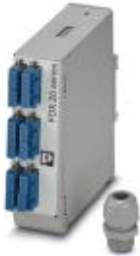
DIN rail splice box, without pigtails, for 6x SC duplex

Please be informed that the data shown in this PDF Document is generated from our Online Catalog. Please find the complete data in the user's documentation. Our General Terms of Use for Downloads are valid ( http://phoenixcontact.com/download )