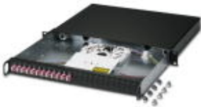
19" splice box, black, 12 x LC duplex OM4

19" splice box, black, 1 RU, fully pre-assembled ready to splice, for 12x LC duplex OM4