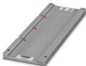
Magazine, for CMS-P1-PLOTTER and PLOTMARK, for accommodating UC-TM..., UC-TMN..., UC-WMC 3,1..., UC-WMTBA...

Please be informed that the data shown in this PDF Document is generated from our Online Catalog. Please find the complete data in the user's documentation. Our General Terms of Use for Downloads are valid ( http://phoenixcontact.com/download )