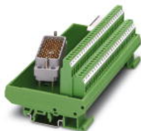
Interface module, connection 1: Screw connection, connection 2: ELCO connector 1x 56-position (Pin strip, Type 8016, right)

Please be informed that the data shown in this PDF Document is generated from our Online Catalog. Please find the complete data in the user's documentation. Our General Terms of Use for Downloads are valid ( http://phoenixcontact.com/download )