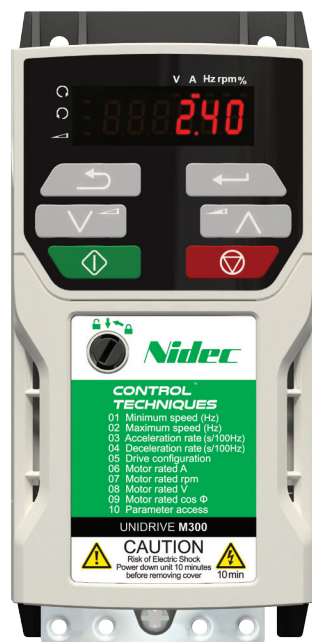
Unidrive M300 Frame Size 1