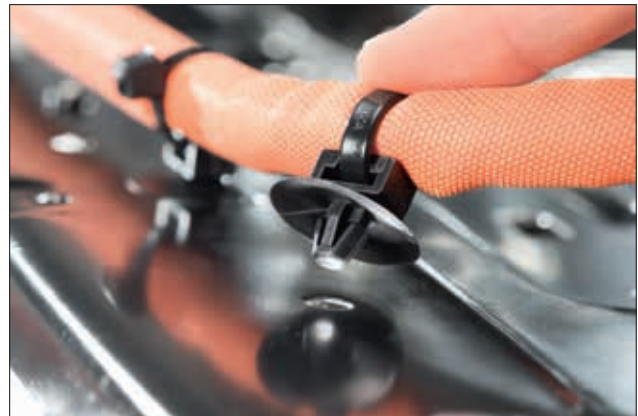
The SFC3 series for securely fixing and to route cables and pipes.