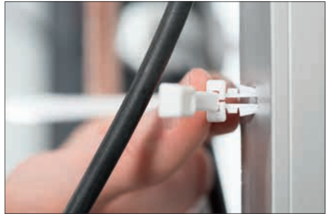
TM1SF for secure fixing of cables into pre-drilled or pre-punched holes.