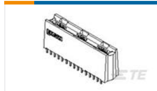
TE Model / Part #6650383-1 284-0102-11300=CONN,SKT,COMP