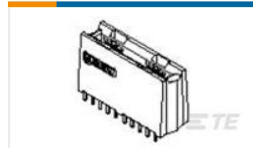
TE Model / Part #6651170-2 285-0102-11300=CONN,SKT,COMP