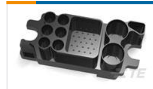
TE Model / Part #1648151-1 241-27-01100