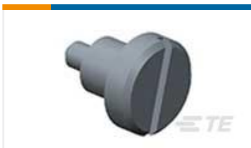
TE Model / Part #1650106-1 902-84-02113=SCREW,SHOULDER,#6-32