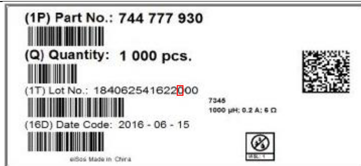
Label example for pad printing (13th digit marked in red)