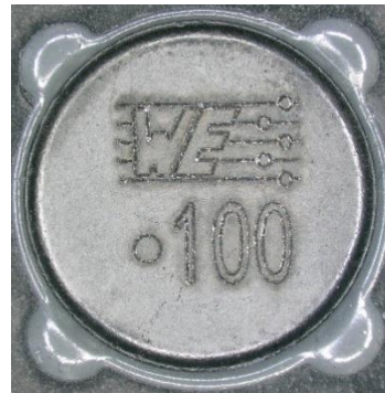
Marking with Laser Marking