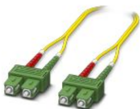
Single-mode OS2 duplex jumper, SC-SC, APC polishing, length 1 m

Please be informed that the data shown in this PDF Document is generated from our Online Catalog. Please find the complete data in the user's documentation. Our General Terms of Use for Downloads are valid ( http://phoenixcontact.com/download )