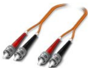
Multi-mode OM2 duplex jumper, ST-ST, UPC polishing, length 0.5 m

Please be informed that the data shown in this PDF Document is generated from our Online Catalog. Please find the complete data in the user's documentation. Our General Terms of Use for Downloads are valid ( http://phoenixcontact.com/download )