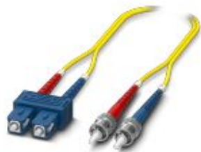
Single-mode OS2 duplex jumper, ST-SC, UPC polishing, length 5 m

Please be informed that the data shown in this PDF Document is generated from our Online Catalog. Please find the complete data in the user's documentation. Our General Terms of Use for Downloads are valid ( http://phoenixcontact.com/download )