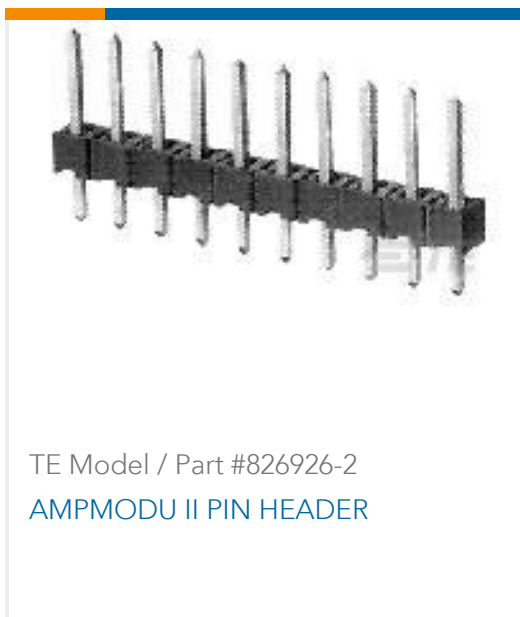
TE Model / Part #826926-2 AMPMODU II PIN HEADER