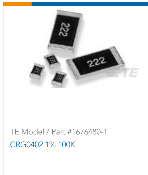
TE Model / Part #1676480-1 CRG0402 1% 100K