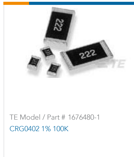
TE Model / Part # 1676480-1 CRG0402 1% 100K