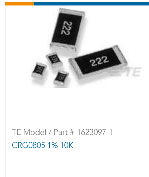
TE Model / Part # 1623097-1 CRG0805 1% 10K