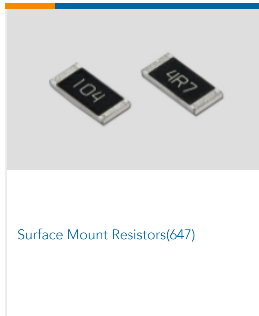
Surface Mount Resistors(647)