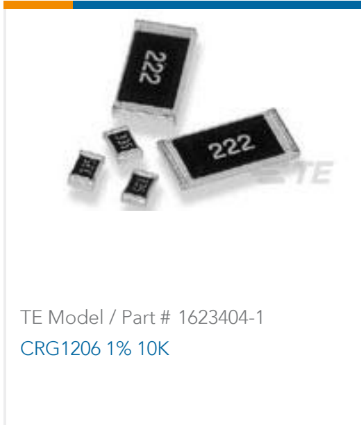
TE Model / Part # 1623404-1 CRG1206 1% 10K