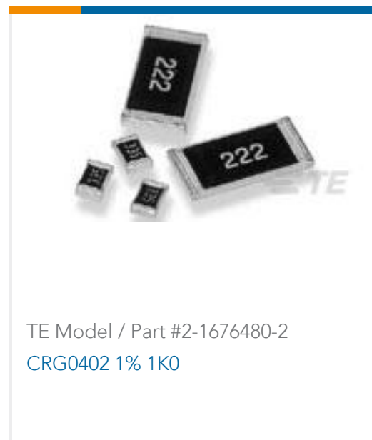
TE Model / Part #2-1676480-2 CRG0402 1% 1K0