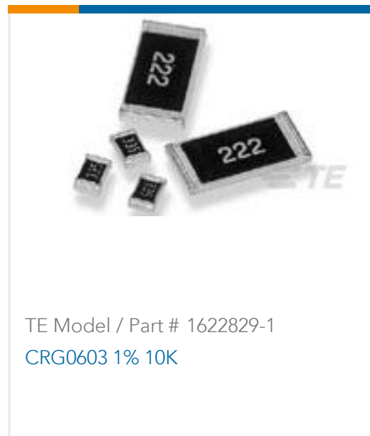
TE Model / Part # 1622829-1 CRG0603 1% 10K