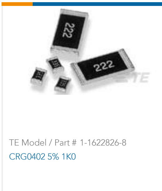
TE Model / Part # 1-1622826-8 CRG0402 5% 1K0