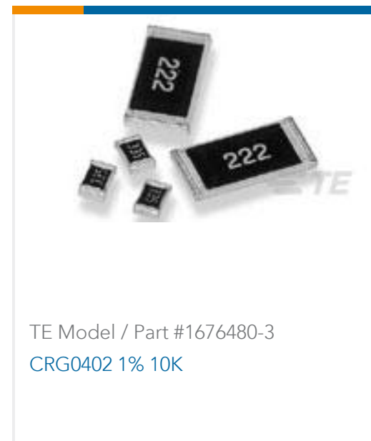
TE Model / Part #1676480-3 CRG0402 1% 10K