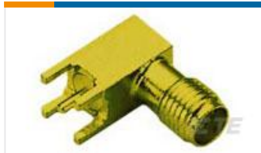
TE Model / Part #3-1478978-1 SMA R/A PCB SKT GB