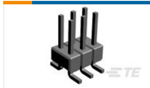
TE Model / Part #1241050-3 2x3P MOD II BREAK AWAY HDR,SMD, BLISTER