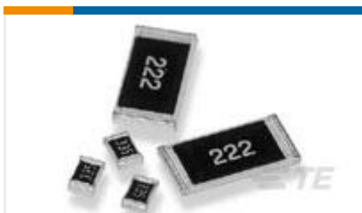
TE Model / Part #1676480-2 CRG0402 1% 100R