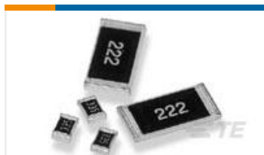
TE Model / Part #1676480-3 CRG0402 1% 10K