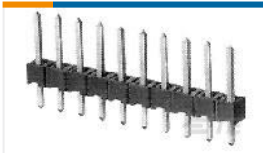
TE Model / Part #826926-3 3P AMPMODU II PIN HDR.