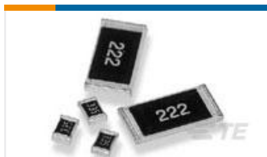
TE Model / Part #2-1676480-2 CRG0402 1% 1K0