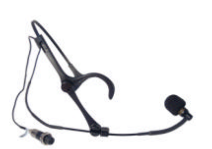
MU-53H Head-band Microphone

A range of microphones to use with the receiver units MA-101, MA-707 and MR-515. Select from MH-203 hand-held with in-built transmitter, MU-53H headset or MU-53L lapel microphone. The MU-53H and MU-53L require the MT-103 belt pack transmitter.