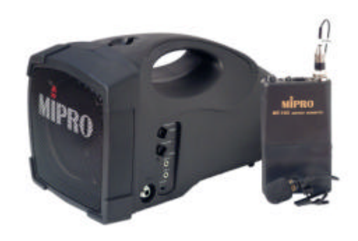
MA-101 with MT-103 and Lapel Microphone