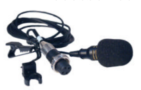
MU-53L Lapel Microphone