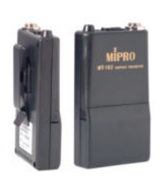
MT-103 Belt Pack Transmitter