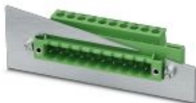
The figure shows a 10-position version of the product

Feed-through connector, nominal current: 12 A, rated voltage (III/2): 320 V, nominal cross section: 2.5 mm 2 , number of positions: 6, pitch: 5.08 mm, connection method: Screw connection with tension sleeve, color: green, contact surface: Tin